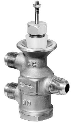
VB-4332 Series Three-Way Mixing