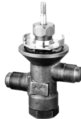
VB-3966 Series Push-Down-To-Open