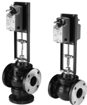
M9100 Non-Spring Return Actuated VG2000 Valves