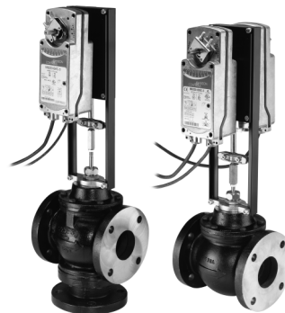
M9220 Spring Return Actuated VG2000 Valves