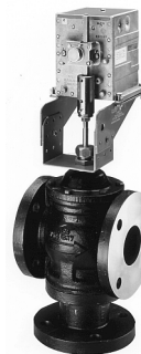
M100 Actuated Three-Way VG2000 Series Valve