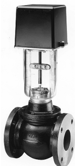
VA-3100 Actuated Two-Way VG2000 Series Valves