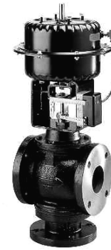
MP84 Actuated VG2000 Valve