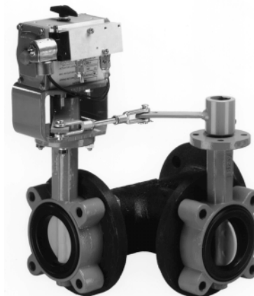
Three-Way Valve with Industrial Grade, Spring Return, V-919x Series High Pressure Pneumatic Actuator