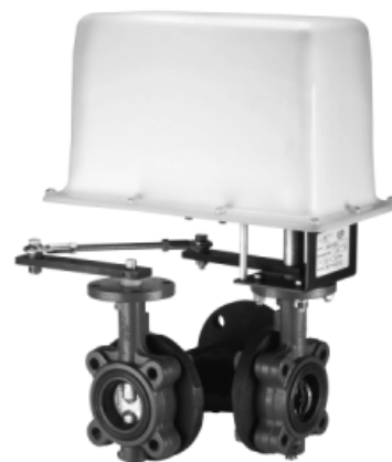
M9000 Electrically Actuated Standard-Pressure, Standard-Temperature Three-Way Butterfly Valves with Weather Shield

If the M9000 Electrically Actuated Standard-Pressure, Standard-Temperature Two-Way Butterfly Valve fails to operate within its specifications, refer to the VF Series M9000 Electrically and D-3000 Pneumatically Actuated Standard-Pressure, Standard-Temperature Butterfly Valves Product Bulletin (LIT-977202) for a list of repair parts available.