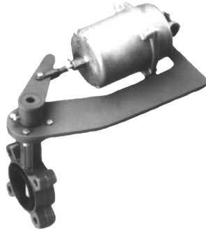
Two-Way VF Butterfly Valve with D-3153 Actuator