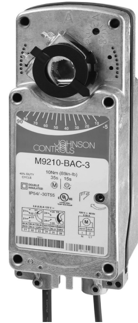
M9210 Series Electric Spring Return Actuator