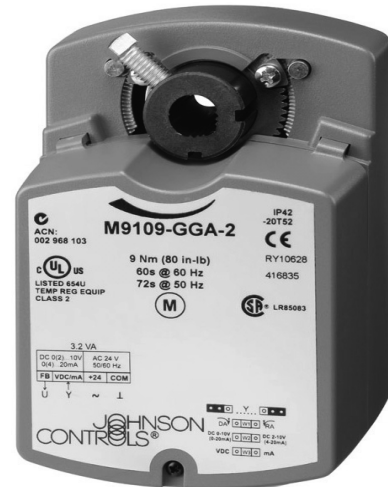
M9109-xGx-2 Series Electric Non-spring Return Actuator