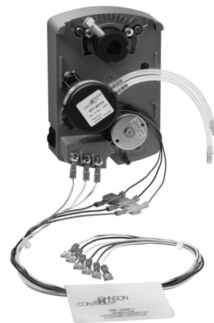
M9106-AGS-2N0x Series Electric Non-spring Return Actuator

For more information, refer to the M9106-AGx-2N0x Electric Non-spring Return Actuators Product Bulletin, LIT-2681126 or the M9106-AGx-2N0x Electric Non-spring Return Actuators Installation Instructions, Part No. 34-636-1077 .