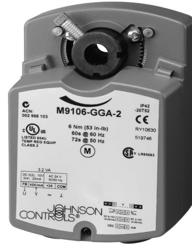
M9106-xGx-2 Series Electric Non-spring Return Actuator

The M9106 actuators are used to position balancing, control, round, and zone dampers in typical HVAC applications. The M9106 can also be used with a M9000-520 linkage to control 1/2" (DN15) to 1-1/2" (DN40) VG1000 series ball valves. M9106 mounts directly on the duct surface, round damper, or small rectangular damper with an anti-rotation bracket and two sheet metal screws (included). Additional linkages or couplers are not required. Refer to the damper or VAV box manufacturer's information to select the proper timing for the actuator. Refer to the appropriate application note for specific wiring diagrams and information. For more information, refer to the M9106-xGx-2 Electric Non-spring Return Actuators Product Bulletin , LIT-2681123 or the M9106-xGx-2 Electric Non-spring Return Actuators Installation Instructions , Part No. 34-636-1085.